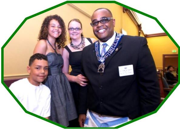
Worshipful Master with family