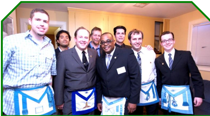
The officers waiting and waiting to be installed. In the words of the Bard of Stratford on Avon "A motley crew – motley is the only wear."