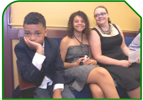
“Hey Dad! Can't you wrap this thing up. I'm getting bored and I'll bet everyone else is too.”