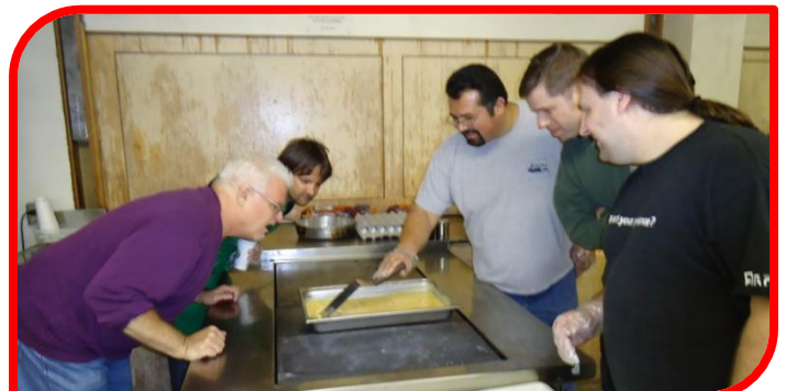
Supervisors checking the scrambled eggs for the morning meal.