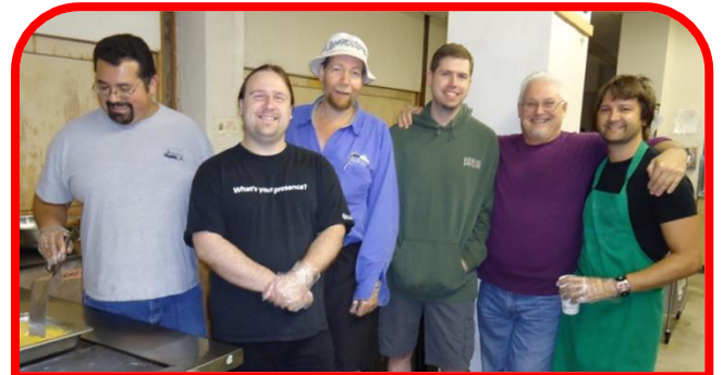
One Early Sunday Morning Breakfast Team

August marks the start of the second year of Lodge's participation in the ROOTS Project at the University Methodist Church. On the 2 nd and 4 th Sunday of the month Daylighters and sometime friends show up at 6:00 a.m. to cook breakfast for the Homeless Street Kids in the University District. Up to 25 kids are given a place to spend the night and get a good meal in the evening and morning. The church and its supporters provide showers, bedding, clothes washing facilities. St. John's Lodge No. 9 participates on an "On Call" basis for the evening 'Teen Feed.' University Lodge #141 and Oriental Royal Arch Chapter #19 have donated cash to support the program and the money collected by University Lodge at the U District 5 Street Fair this year was donated to the cause.